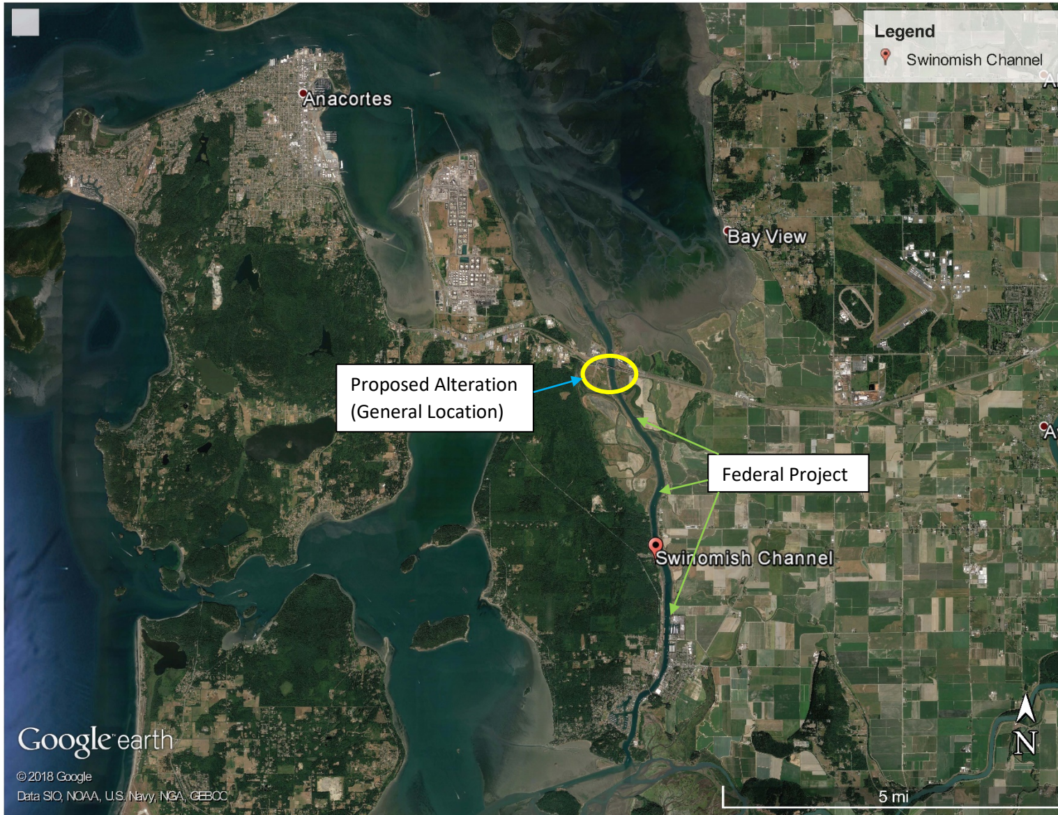
Figure 1. General Location of the Proposed Alteration and the Federal Project (Swinomish Channel)